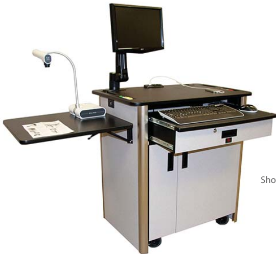
Shown with options