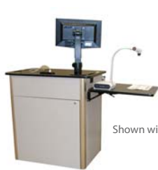
Shown with options